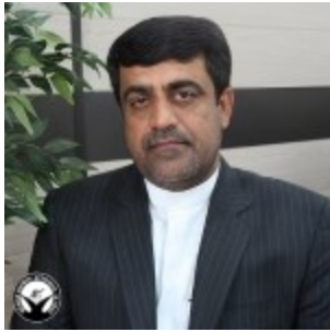
5. Saheb-Gol Salehi – Governor of Khash County