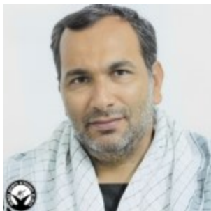
15. Hamze Dehghan – Chief of Information Protection of Quds Corps in the province. ( Haalvsh, 2023 ).