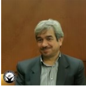
4. Ali Shabani – deputy governor of Sistan and Baluchestan and special governor of Iranshahr city at the time