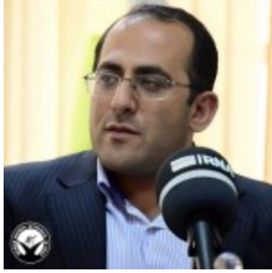
3. Abozar Mahdi Nakhai – The acting governor of Zahedan and governor of Zahedan county