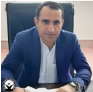
6. Salman Borhani – Governor of Bampur County