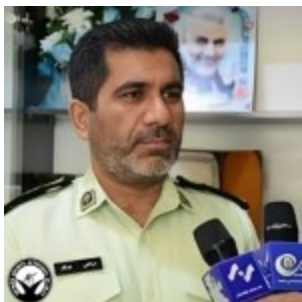
16. Morteza Jokar – Deputy Commander of the Provincial Police Force ( Haalvsh, 2023 ).