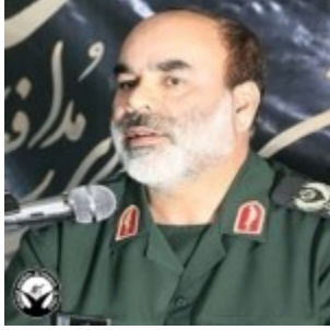
2. Mohammad Karami – Governor of Sistan and Baluchestan province.